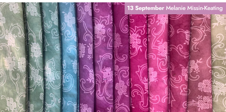
13 September Melanie Missin-Keating

Find more details and how to book these demonstrations at: eventbrite | embroiderers guild